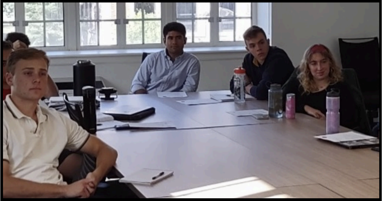
Wolverine Battalion Cadets at the September seminar meeting