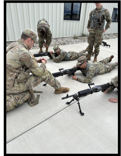
Top: Cadets learning weapon maintenance Bottom Left: Cadet navigating the confidence course Bottom Right: Battalion photo op after completing FTX

During the weekend of September 5-7, our cadets participated in the Fall Field Training Exercise (FTX) at Fort Custer. Over this weekend, cadets spent their time learning about weapons systems, completing Confidence and Leadership Reaction courses, utilizing the Engagement Skills Trainer, and conducting day and night land navigation exercises. FTX presents an opportunity for cadets to learn from their elder peers to prepare for what they will see at CST and at various other schools within the Army. These experiences allow our cadets to see and participate in events that they wouldn't be able to do in class or lab.