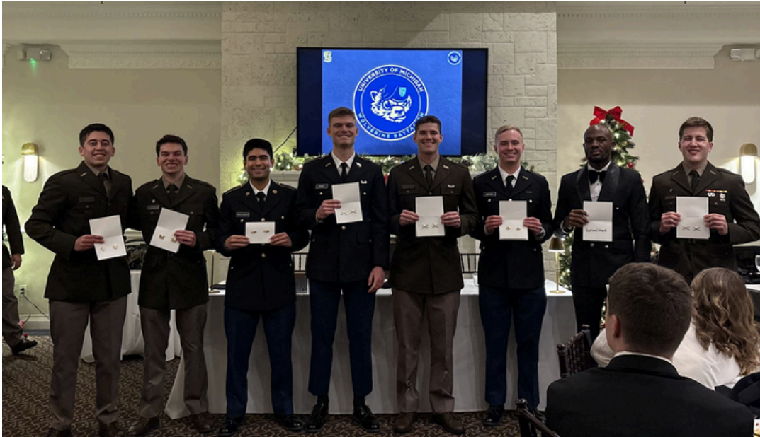
MSIV Cadets with their Branch Assignments

After a busy semester, the annual dining in ceremony took place on December 5. As is tradition, the focus of dining in is on the seniors,, where we celebrate their accomplishments, and reveal the branch assignments of each senior, as shown to the right.