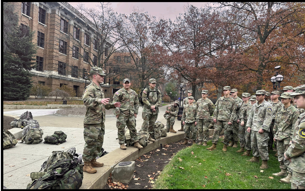
Cadets preparing before the ruck

On November 15th, the battalion conducted a 15 km ruck in support of the Stop Soldier Suicide foundation. The University of Michigan Campus Ruck raised $1,331, exceeding the original goal by $331, to support an important cause that helps provide life-saving care, raise awareness, connect communities, and support at-risk veterans and service members. We are proud to have been a part of the mission to end the suicide crisis within the military community.